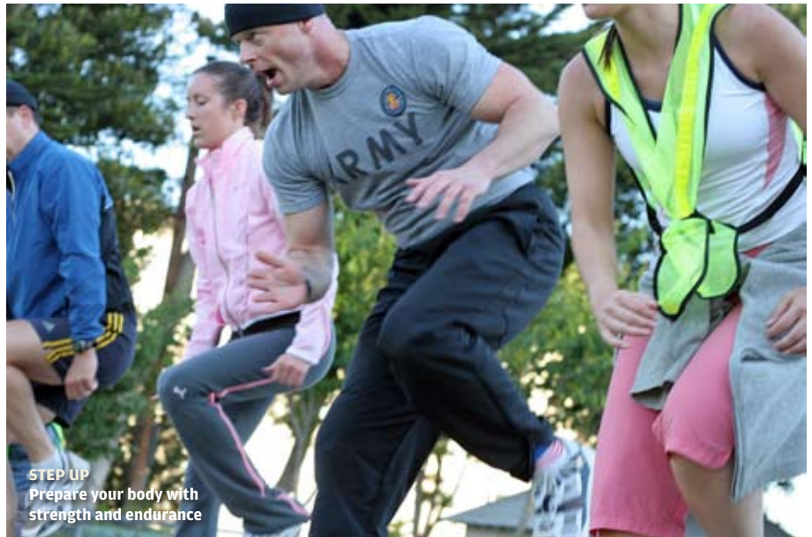
STEP UP Prepare your body with strength and endurance

Rest 2 MIN Crunches 3 MIN Stretching Exercises (Cool Down) 8-10 Min