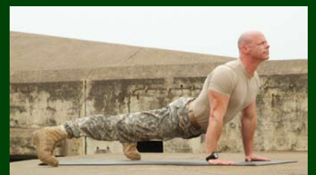
ILLUSTRATION BY SEAMAS GALLAGHER, NICOLE SYLVESTER; PHOTOS BY JONATHAN MILLER