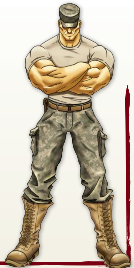
JONATHAN MILLER / ILLUSTRATION BY SEAMAS GALLAGHER, NICOLE SYLVESTER