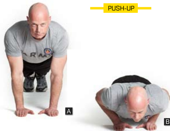
— CLOSE GRIP —

Notes: The repetition counts when you return to the start position. It is authorized to temporarily rest by raising your hips. You cannot sag your back, go to your knees, or lift your hands or feet off of the ground. You must return to the start position before resuming the exercise.