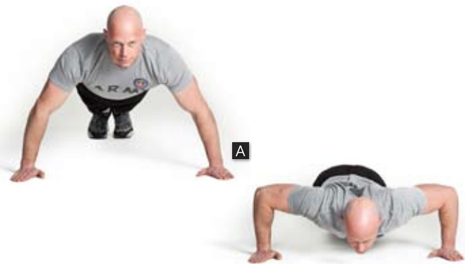
— WIDE GRIP —