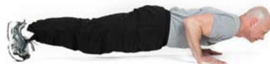
— NORMAL GRIP —