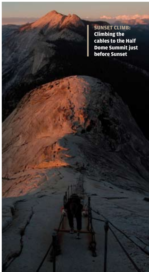
SUNSET CLIMB: Climbing the cables to the Half Dome Summit just before Sunset

The United States military training is second to none! My first military tour of duty was with an active duty Air Defense unit (Patriot). Immediately after that I joined the Army National Guard. I cannot think of a better opportunity to serve our state and our country. In return we receive the same physical fitness and survivability training that our active duty colleagues receive and a great deal of college money as well. Most