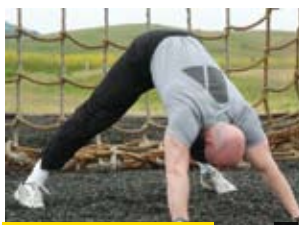
DIVE BOMBER PUSH-UP