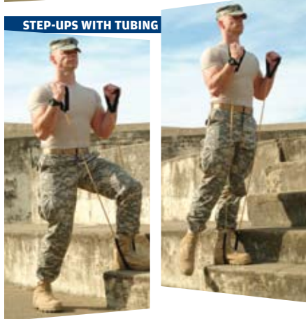
STEP-UPS WITH TUBING