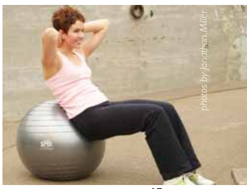
Military Spouse | April 2007 65