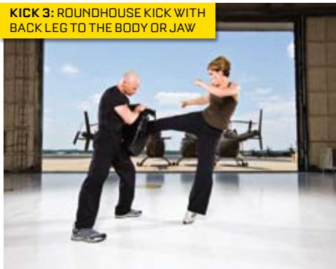
KICK 3: ROUNDHOUSE KICK WITH BACK LEG TO THE BODY OR JAW